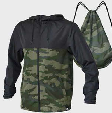
BLACK & CAMO