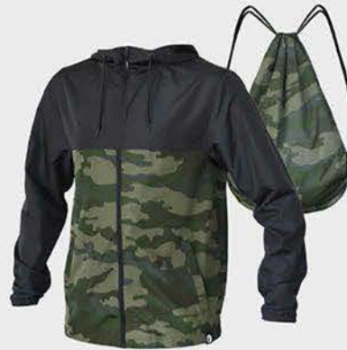
BLACK & CAMO